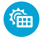
Off grid solar system